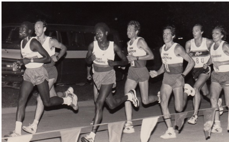
The best of ISU & Midwest runners battled the long race in the dark.