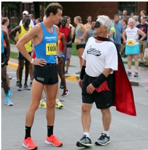
The Captain hangs up his cap after 33 years.