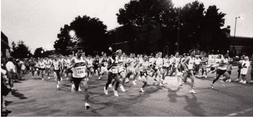
After years running around ISU Center . . . the race moved downtown, a mad change.