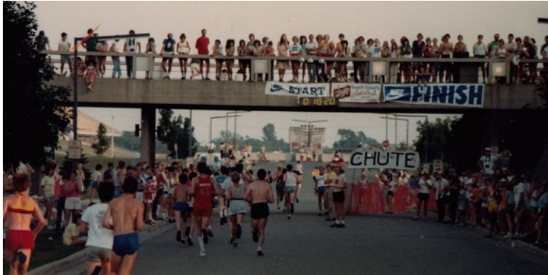
Always a loop course, in the early days starting & finishing next to Hilton.

But through all the years, Midnight Madness has been the best way to celebrate Iowa running on an often hot, humid night in the comfortable confines of Ames and Iowa State.